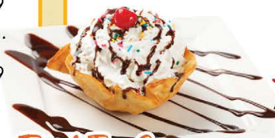
Fried Ice Cream

Chimi Cheesecake 5.99 Chimi with cheesecake filling.