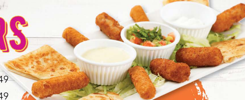
Chris King Sampler

Six rolls, stuffed with corn, black beans, chicken, bell peppers, onions, tomatoes, and spicy white sauce. 12.99