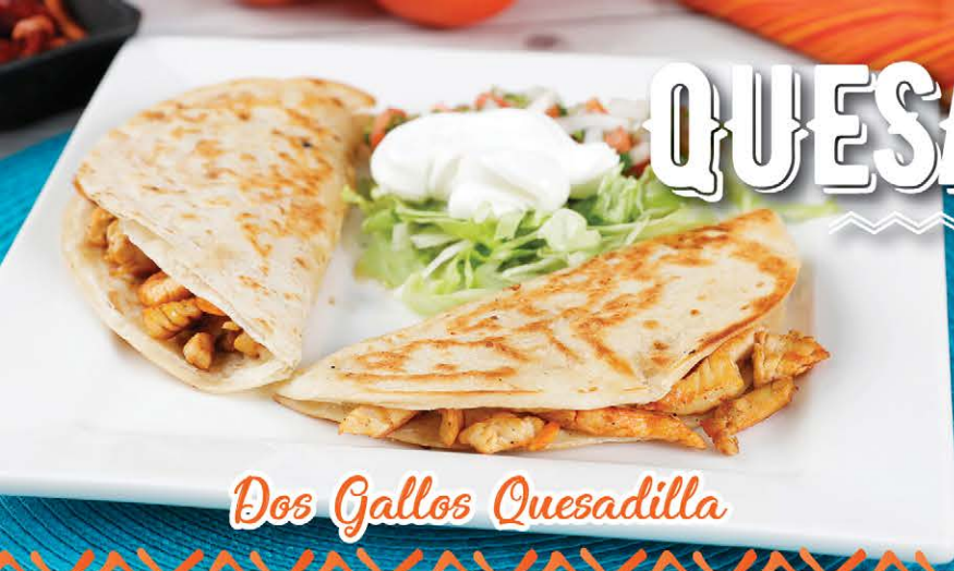
Dos Gallos Quesadilla