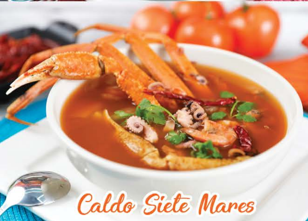
Caldo Siete Mares