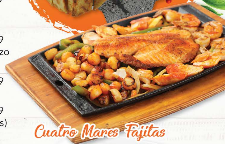
Cuatro Mares Fajitas