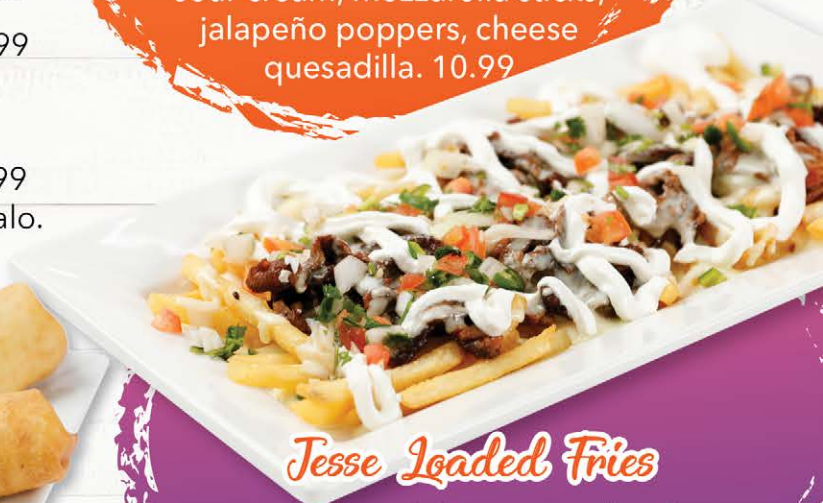
Jesse Loaded Fries

Cheese dip, guacamole dip, sour cream, mozzarella sticks, jalapeño poppers, cheese quesadilla. 10.99