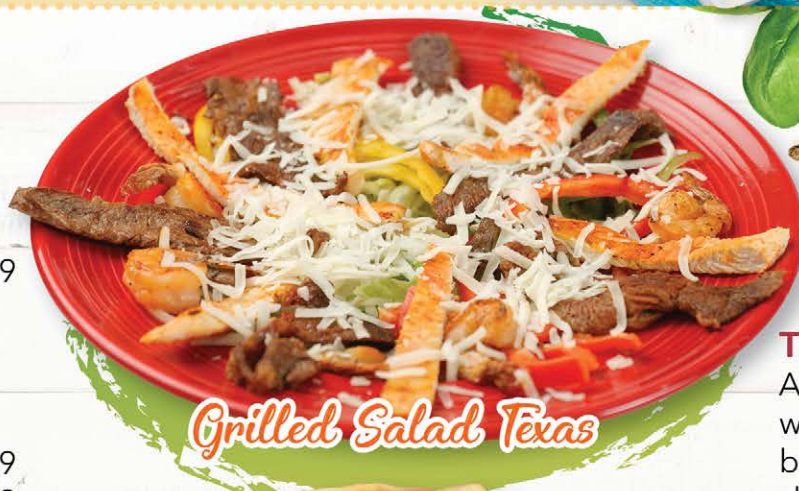
Grilled Salad Texas

Guacamole Salad 6.99 Lettuce, tomato, guacamole, and shredded cheese.