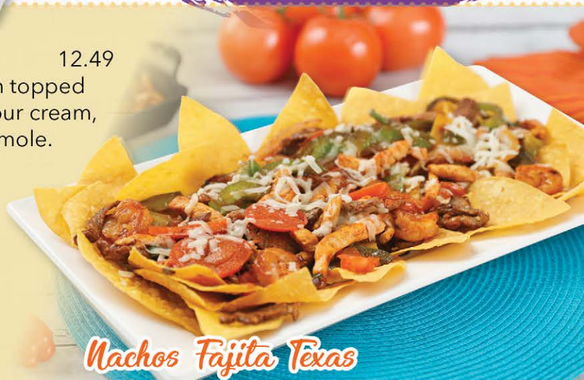
Nachos Fajita Texas