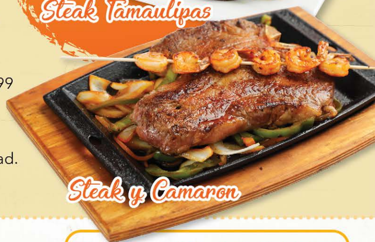
Steak y Camaron